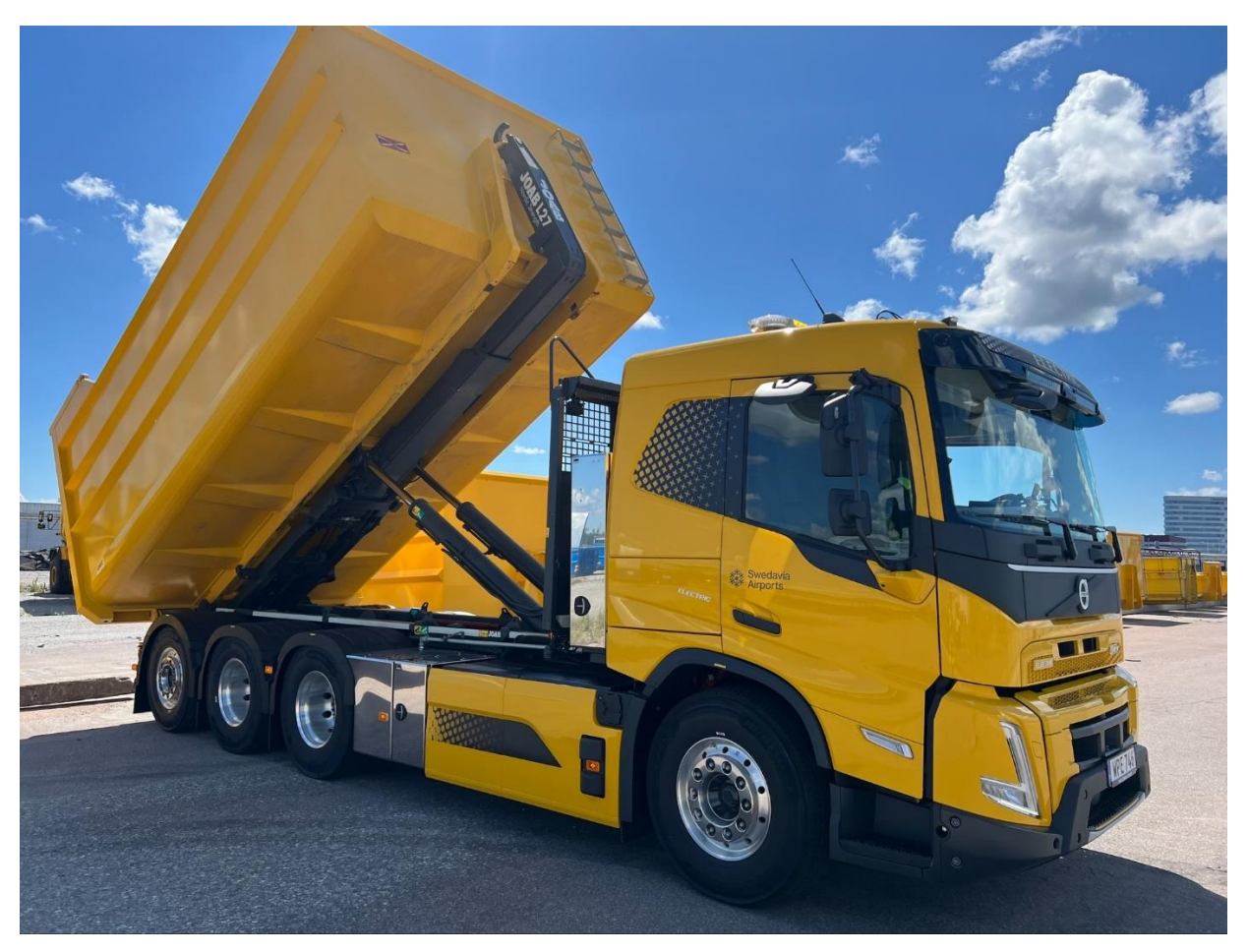
The truck in the picture is powered by electricity and was delivered to Stockholm Arlanda Airport in 2024. It is used for transportation of snow, sand and soil.

Our investments in charging infrastructure – which enables not just us but our business partners and passengers to use electric vehicles – also fall into this category.